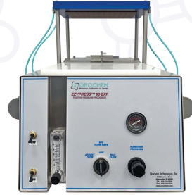
EZYPRESS 96 EXP

Our machine is capable of processing analyte samples with varying viscosities by allowing for gas pressures of 30 psi and providing a greater motive force for the samples. Based on the sample viscosity, the applied pressure can be easily adjusted using the dual pressure regulators on the front of the machine to provide smooth flow response and control.